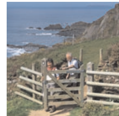
Coast Path near Speke's Mill