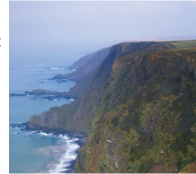
Coast Path near Longpeak

On the road leave the coast path behind, taking the road opposite to Hardisworthy.